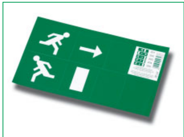
Zeta II legend kit